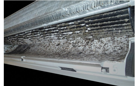
Mold thrives on mini-split blower wheels