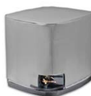
Condensing unit covers