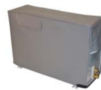
Ductless Split Covers