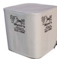
Custom printed covers