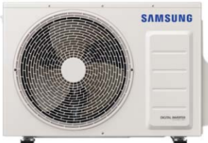
(actual equipment appearance may vary)