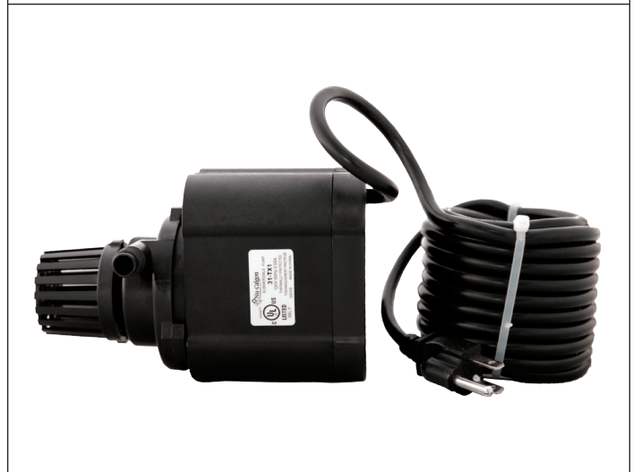
*No gallon reservoir, submerge only.