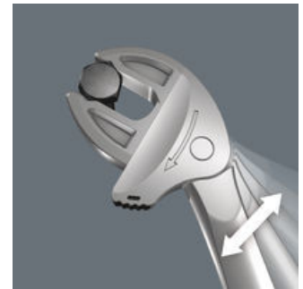
Joker 6004: Ratchet mechanism for fast work

The ratchet function in the mouth sees to fast and consistent screwdriving without removing the tool.