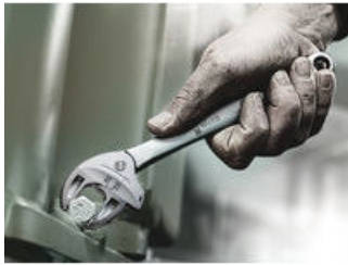
Joker 6004: Automatically and continuously self-setting